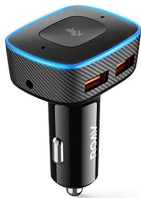
Figure 1: Alexa Enabled Roav VIVA Pro

In the package, you'll find the Roav VIVA or VIVA Pro car charging unit that resembles a slightly larger version of a standard car charger for your phone. It features two 2.4A PowerIQ-equipped USB charging ports in a standard looking car charger, but that's where the similarity ends. The device includes an Alexa light ring plus a mute button on top for activating the Alexa.